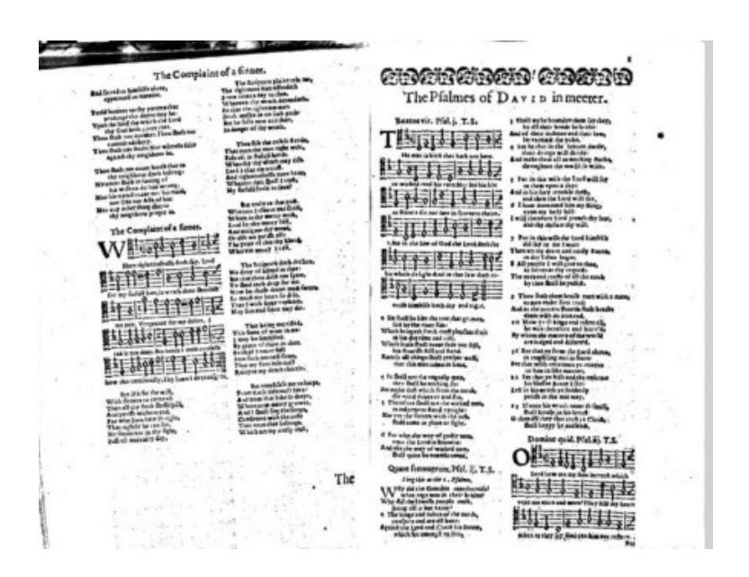
Page from Sternhold and Hopkins The Whole Book of the Psalmes, 1631